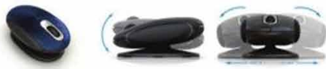
Smartfish Whirl Mini-Mouse

away from an outlet for so long during the day that the battery in our phone can no longer survive. It can be disastrous for those students