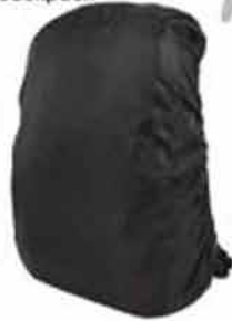
Cocoon's CP Pro Backpack

B ack in the day, people took notes by hand, read books, did research using the card catalogue in libraries, and, yes, walked through a foot of snow — uphill both ways — to get to campus. Life has changed. And aren't you glad it has? Here's a quick look at some new gadgets designed to make your life as a student easier.